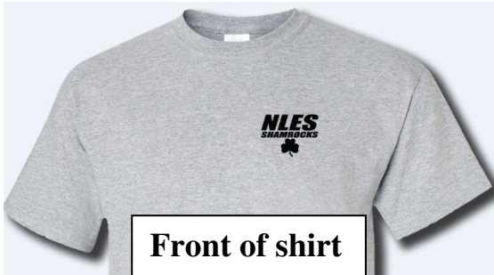
Front of shirt