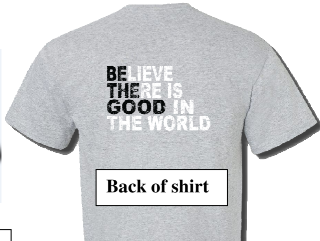
Back of shirt

Order forms for other JGSC School Shirts are available in each school office and on NLES website.